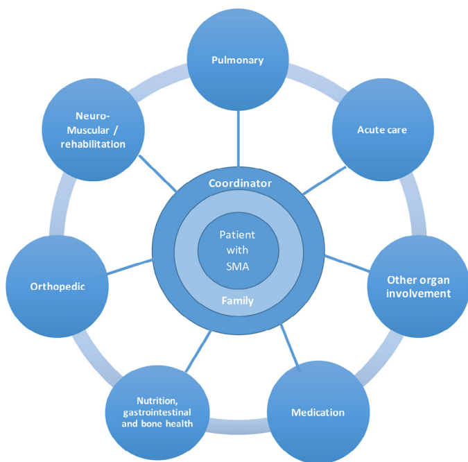
Fig. 2. Multidisciplinary approach.

mentioned when reporting the number of copies or counseling patients or their families.